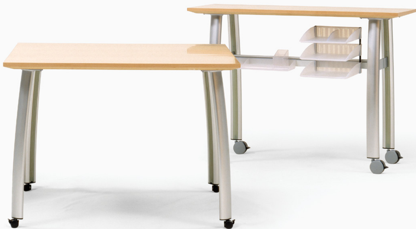
Square four-leg table with casters, mobile cart