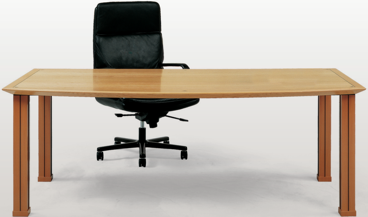
TRIUNA II WIDTH: 36 TO 240, DEPENDING ON SHAPE | DEPTH: 30 TO 108, DEPENDING ON SHAPE | HEIGHT: 29

The Triuna II™ table collection offers hand-crafted detailing through a variety of marquetry and solid-wood trim options. Triuna II desk and conference tables take shape as round, square, rectangular, racetrack and arc-front surfaces, while Scarpa occasional tables provide square, round and rectangular options, including a square with diamond-shaped inlay. Both Triuna II and Scarpa tables feature Triuna casegoods' signature knife edge. Designed by Manfred Petri and Geiger Design Group.